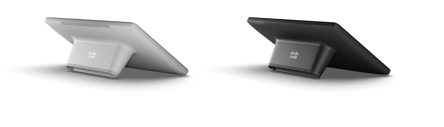
Above: The rear side of Cisco Room Navigator for Table in First Light and Carbon Black models

The list above reflects the regulations applicable at the time of publishing this document. For an updated list of regulations applicable, see the Product Approval Status Database for approval documents per country.