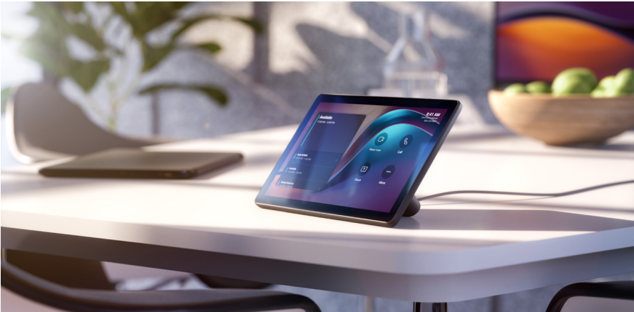
Left: Cisco Room Navigator in Carbon Black running the native Microsoft Teams Rooms Console experience

With the Cisco approach to workspace intelligence, you can significantly simplify your deployment, lower total cost of ownership and ease management with a single vendor for interoperable video devices, the underlying meeting service, the room control hardware, and room booking software solution.