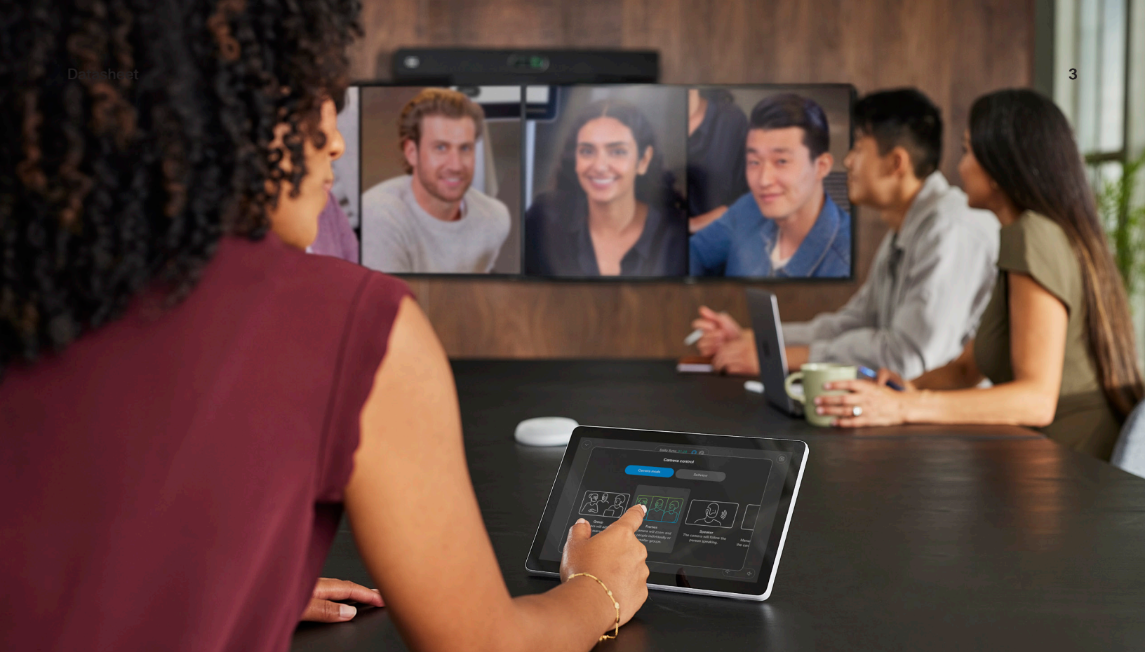
Above: Cisco Room Navigator for Table unit used as a touch controller in a Cisco Room Bar Pro deployment

Transform your workplace with simple and intelligent experiences while eliminating the friction from the employee journey. The table-stand Cisco Room Navigator touch touch controller is a purpose-built room device designed to bring ease and convenience into modern workspaces by providing instant access to conference controls, smart room booking, room controls and your workspace experience workflows.